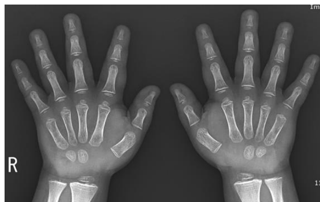
Fig. 1. Bone age radiograph obtained at the chronological age of 8 years and 4 months. The bone age was interpreted as 2 years 4 months using the Greulich and Pyle method.

Antithyroid antibody test results showed that his anti-Tg Ab level was 102.6 U/mL (normal range, 0–100 U/mL), anti-TPO Ab level was 32 U/mL (normal range, 0–100 U/mL), and TSH-binding immunoglobulin level was <5 U/L (normal range, 0–9 U/L). Thyroid ultrasonography was performed (Fig. 2), which showed decreased volume of both thyroid glands and the presence of multiple hypoechoic nodular lesions in both thyroid