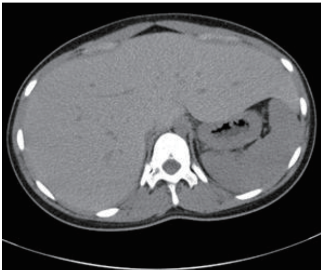
Fig. 1. Abdominal computed tomography revealed hepatomegaly and marked liver attenuation.

GH results from excessive glycogen accumulation in the hepatocytes of patients with poorly controlled diabetes. In hepatocyte, extrahepatic glucose is in equilibrium with intrahepatic glucose due to main hepatic glucose transporter GLUT-2. Glucokinase is the predominant glucose-phosphorylating enzyme in hepatocyte and its activity is modulated by a glucokinase regulatory protein. When blood