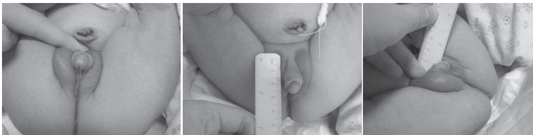
Fig. 1. The external genitalia was characterized by hypospadias and cryptorchidism.

This is the first case study to measure the AMH levels in a patient with DDS. DDS is characterized by a wide variety of genital anomalies including 46,XY DSD. The external genitalia of patients can be female, male or ambiguous. In addition, the internal genitalia can vary and can include normal-sized testes in the normal position together with fully feminized genital organs (vagina, cervix, and uterus); however, there can also be abnormal-sized testes in abnormal positions together with